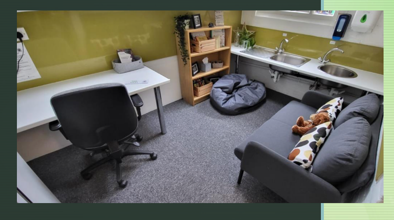
Trauma Informed Practice

We use empathic listening and motivational interviewing to elícit change